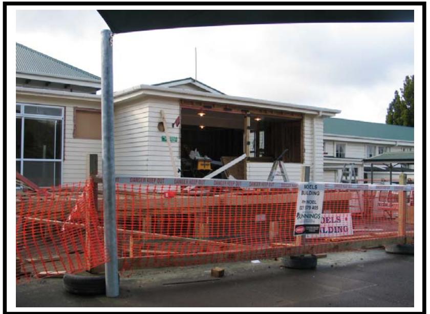
Looking from the senior student toilet area towards the staffroom

Where this presents an inconvenience for parents we are able to provide supervision for students until 3pm.